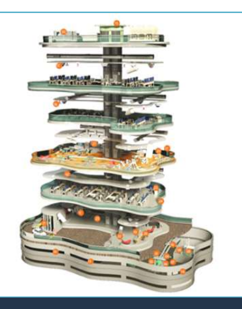
FIGURE 1: Common Building Systems

The number and types of systems that support a Smart Building may vary based on the building type, its occupants, and overall function. Figure 1 above contains a list of common systems in a building that should be considered in scope for cybersecurity.