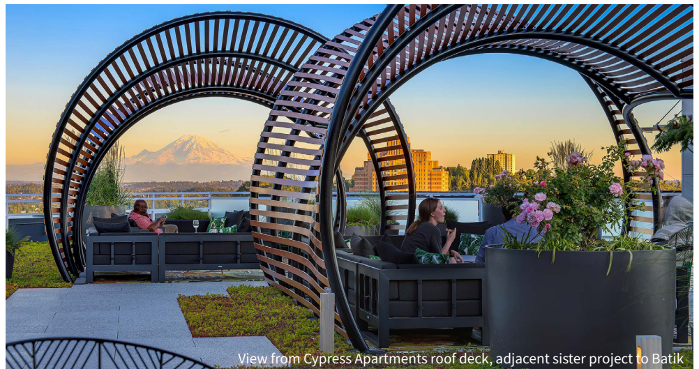
View from Cypress Apartments roof deck, adjacent sister project to Batik

It goes beyond just numbers. To unlock the true value of these properties and achieve each building’s target performance, Runberg Architecture Group builds the design from the inside-out. The programming starts with the basic chassis of the dwelling unit and layering