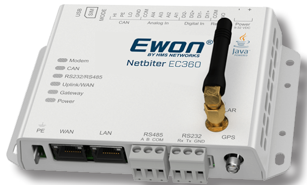
An example of a communication gateway - The Netbiter EC360 from HMS

To communicate with the management server, the gateways generally use either mobile networks, such as GSM/GPRS or 4G, or Ethernet based communication using TCP/IP based protocols.