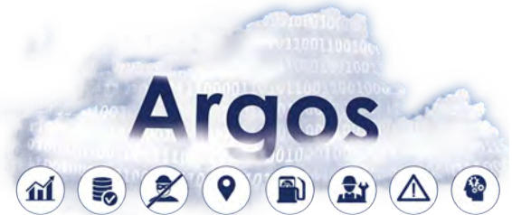
Argos from HMS is an example of a central management server

A remote management system is not only about the information that is collected from the equipment such as power generators. Another important aspect to consider is how to commission, manage and maintain the communication gateways themselves so that they are up to date from a security point of view (more on security later). As the fleet of remote equipment grows over time this can become a major overhead. This is usually referred to as device management.