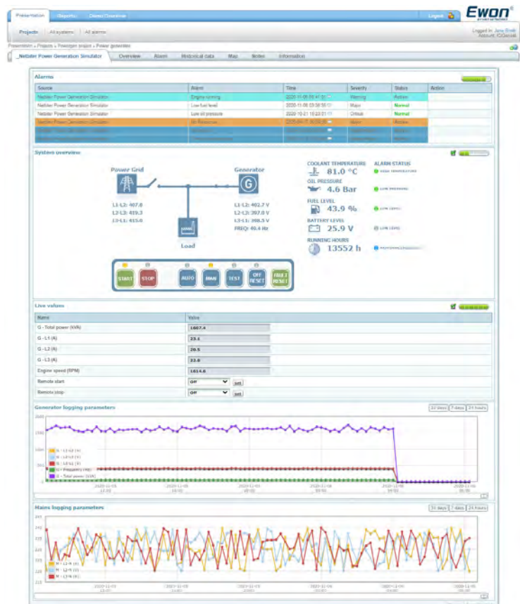
Example of a dashboard

But modern remote management can also offer remote access to your equipment, meaning that you can do configuration remotely using the vendor's own utility/ configuration software. Just like being on site.