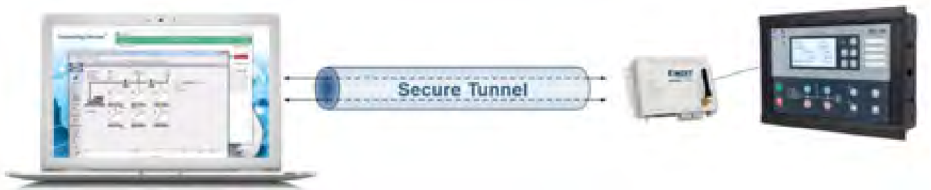
A remote access connection of DEIF controllers enabling using DEIF utility software remotely.

Remote access is an important part of a remote management system to enable sophisticated trouble shooting.