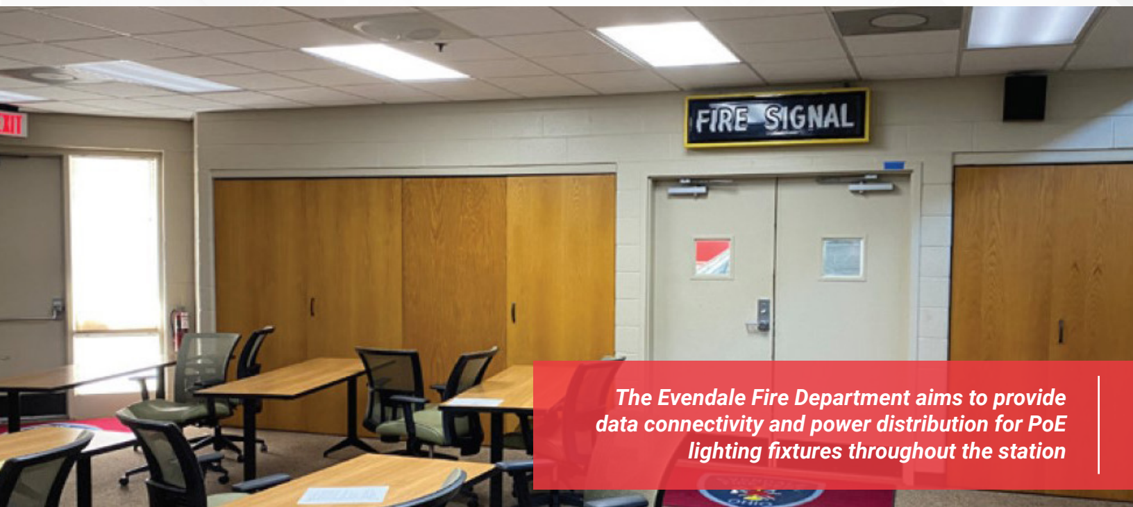
The Evendale Fire Department aims to provide data connectivity and power distribution for PoE lighting fixtures throughout the station