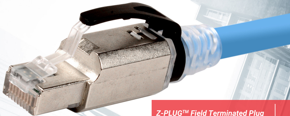
Z-PLUG™ Field Terminated Plug