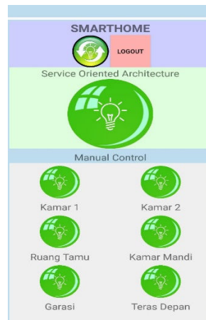
Figure 4. Display Lamp All On

In Figure 4 the light button on the application is green because the status of the light is currently on or on. The big green button in the image above functions to turn the lights on or off at once for all rooms. The testing in this study is testing the time to access the web server with certain upload and download limits. This test aims to find out how long it takes to access the server from the client with limits limited to 1 Kbps, 4 Kbps, 8 Kbps, 16 Kbps, 32 Kbps, 64 Kbps, 256 Kbps, 512 Kbps and unlimited. The following is a sample test with a download and upload limit of 64 Kbps.