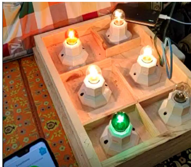
Figure 3. Implementation Results of prototype house lights controlled from Android

The results of the study with the title "Smart Home Based Service Oriented Architecture" are implemented in accordance with the design. The results can be seen in Figure below.