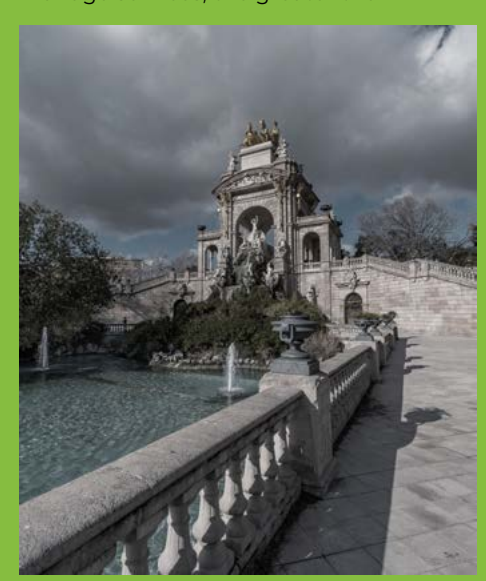
Park Citadel in Barcelona

The more effectively the team can manage services, the greater the