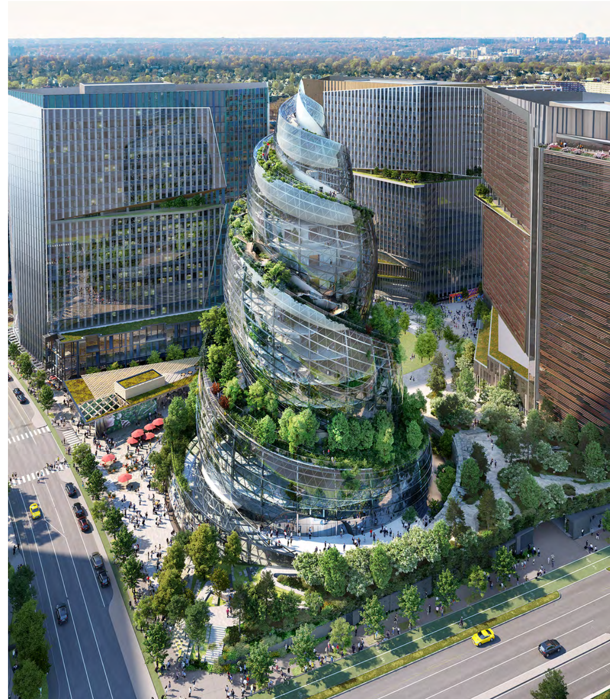
Amazon recently released renderings from the NBBJ architecture firm for "the Helix," part of its multi-billion HQ2 headquarters at the National Landing project in Arlington, Va. The project will include 2.8 million sq ft of new office space in three 22-story buildings. Over the next decade, the company expects National Landing to create 25,000 jobs.

Each local market will enjoy new revenues from the construction niches discussed in this article, so it's important for electrical contractors and other electrical professionals to be in touch with the design and architectural firms as early in the design and build process as possible to identify potential new business opportunities.