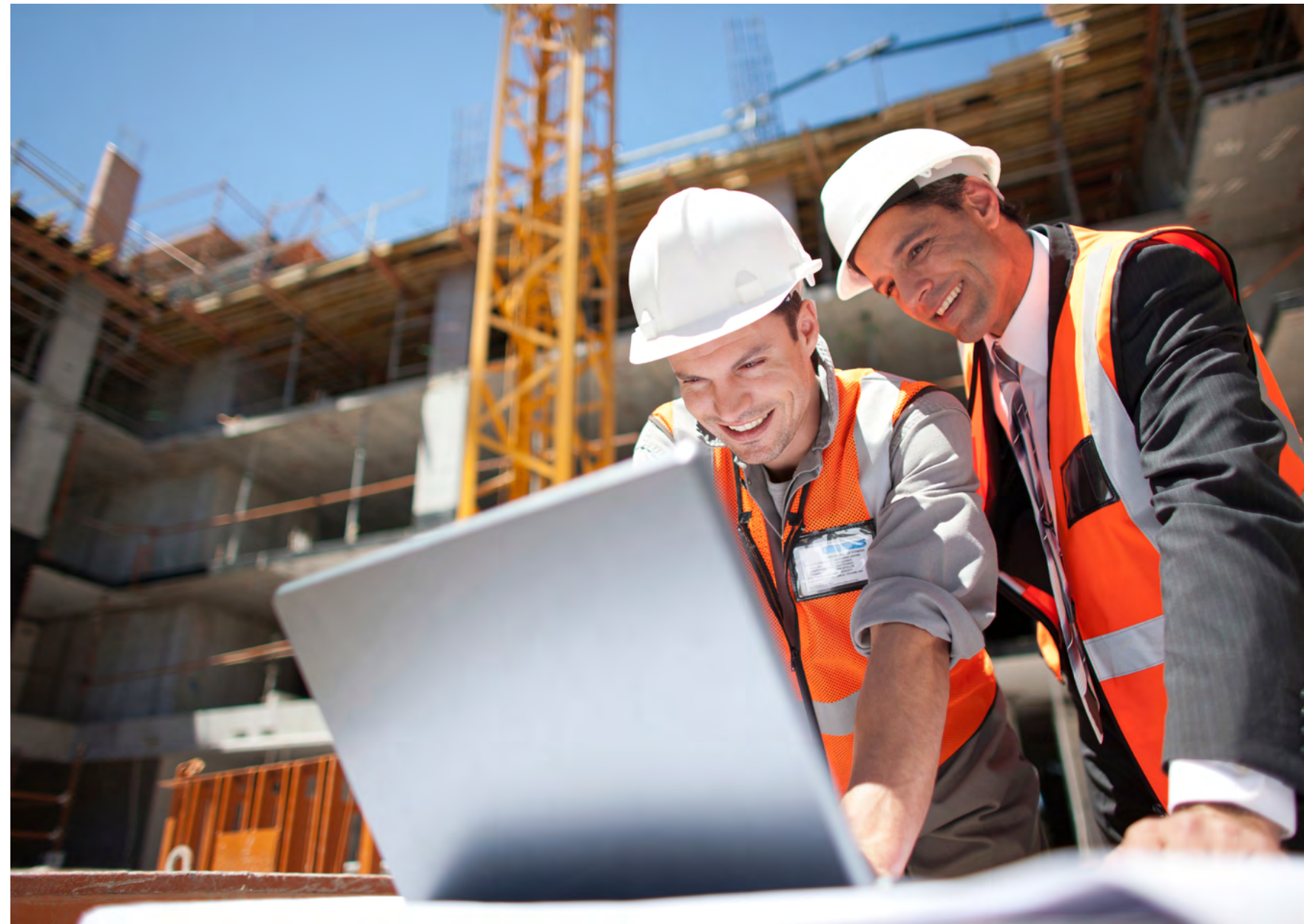
A move to total asset life cycle responsibility will mean a complete overhaul of business models as companies will need to extend their planning horizons significantly to ensure long-term profitability. One way to solve this is to look at enterprise software designed to power the transformational journey from construction-only to through-life service provision.

A move to total asset life cycle responsibility will mean a complete overhaul of business models as companies will need to extend their planning horizons significantly to ensure long-term profitability. Even if they have competent staff to attempt this transformation, it is likely many will initially struggle to establish best practices in service processes that will ensure delivery of new-to-them concepts, such as customer